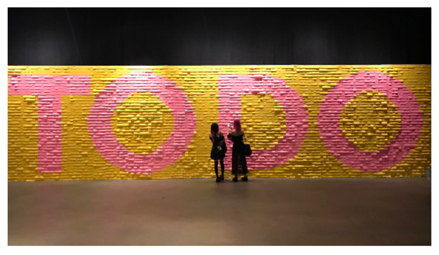
TO DO Wonderspaces, San Diego, CA 2018

TO DO was featured on The New York Times OP-ED page over the 2007 Labor Day weekend to illustrate those things left undone at summer's end. Illegal Art has presented this project and other works at the College Art Association's annual conference and numerous campuses throughout the United States. It is described by the group as the following: "From the refrigerator to the computer screen, the purse to the bathroom mirror: to-dos, commands, reminders, mantras and more have graced these ubiquitous three inch squares around the world. Illegal Art took them to the street in New York City to create three installations that were assembled with up to 18,0006,500 individual Post-its for the passerby to jot, scribble and draw their pressing, and not so pressing tasks and pearls of wisdom." Since then, this projects has been installed in numerous locations.