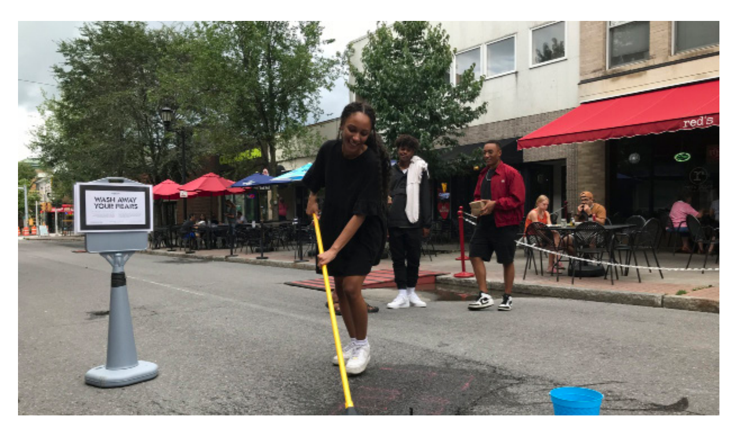
Wash Away Your Fears Ithaca, New York 2021

Wash Away Your Fears prompts the public to grasp the figurative phrase of washing away their fears, and makes it a literal, cathartic action by simply writing them down with chalk on the sidewalk, and then washing them away with a purging bucket of water and a broom. Wash Away Your Fears was first debuted in Provincetown, MA on August 6, 2020 and has since been installed in association with theat the Tenement Museum in the Lower East Side of , New York, NY New York City on October 31, 2020, City of Providence, RI on October 4, 2020, City of Ithaca, NY on August 19, 2021, Englewood, FL on May 20-23, 2022.