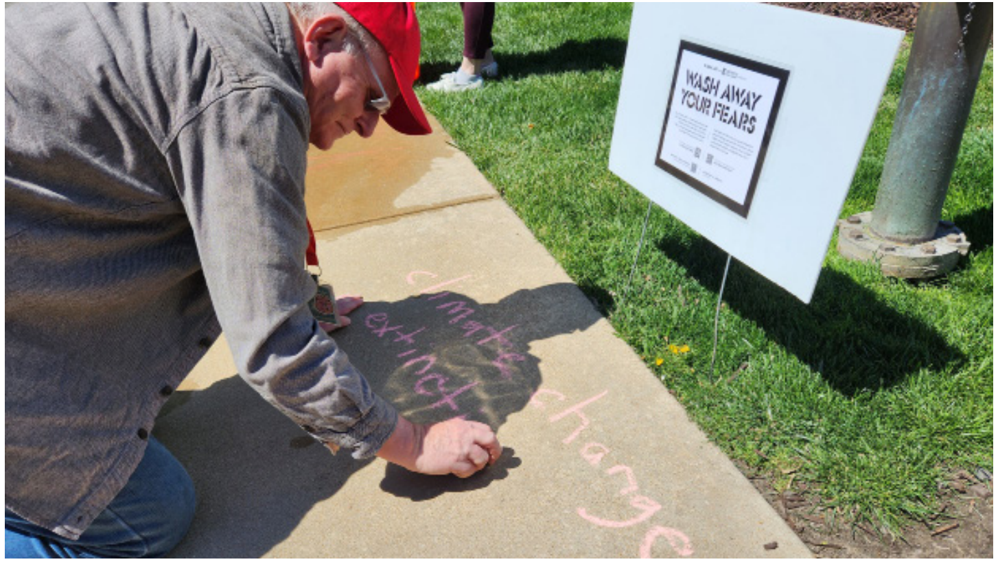
Wash Away Your Fears Kirkwood Public Library, Kirkwood MO 2023